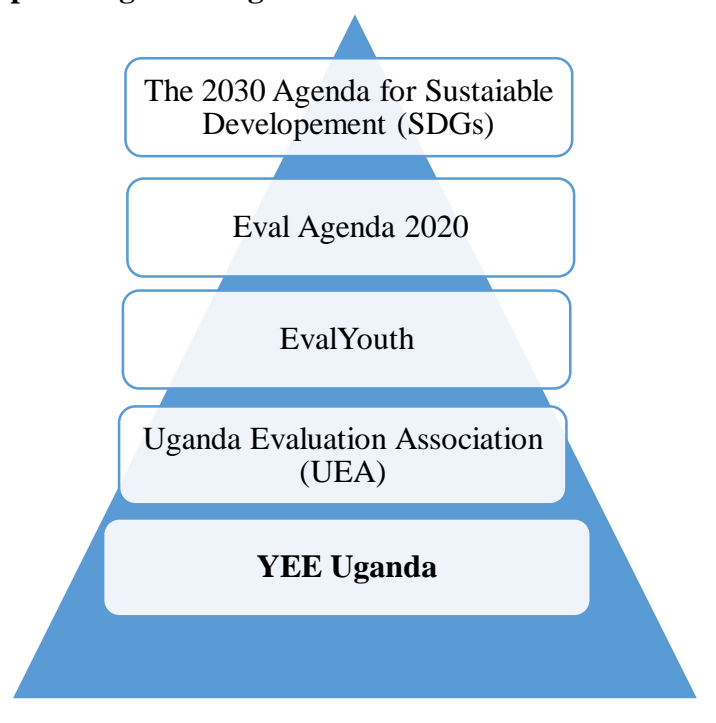
Figure 2: YEE Uganda fits into the global evaluation platforms that are aiming at taping into the potential of youth. These include Evalyouth a programme of Evalpartners and the Eval agenda 2020. All this is aimed at achieving The 2030 Agenda for Sustainable Development (SDGs).